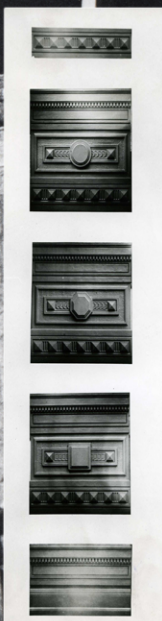
Detail of Custom House, Shanghai window breast panels, c 1927

Building front panels were supplied for the Customs House in Shanghai and a government building in Hong Kong, while a massive 60 ft wide by 43 ft high window surround was manufactured for the Buenos Aires Great Southern Railway in Argentina. Because of their reputation for high quality iron work the Lion Foundry made a significant contribution not only to the built heritage of the United Kingdom but also the wider world.