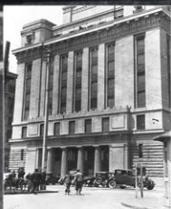
View of front of Shanghai Custom House building. Note the rickshaw at the bottom left of the photograph.