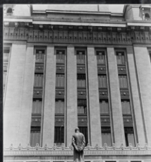
Another view of Custom House, Shanghai