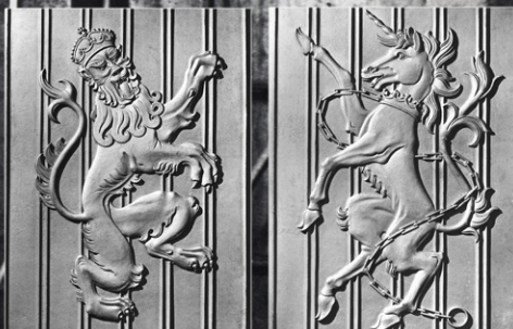
Two panels for a government building in Hong Kong, c 1951. The panels were cast from leak patterns made by the Public Works Department, Hong Kong.