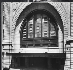
View of the window surround installed at the Plaza Constitution Station, Buenos Aires, 1930

Lion Foundry castings could be found across the United Kingdom from Portsmouth, Bangor and the Isle of Man to Belfast and Banff but the Lion also built up an international reputation. Castings were shipped from Kirkintilloch to locations across the world. For example the firm produced twelve gates and around six thousand feet of ornamental railings for a Prince's residence in Bombay, several porticos for Indian Banks, and the railings for Calcutta race course.