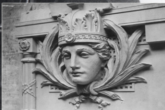
Plaster pattern for decorative feature on a building front panel for Waterloo Station, London, c 1918, modelled by Holmes and Jackson, Glasgow.