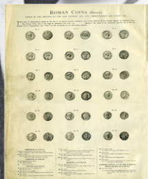
Page from published trade catalogue detailing the Roman coins found at the Lion Foundry site by workmen in 1893.