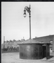
Combined urinal and lamp pillar, c 1900-1910