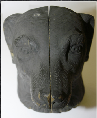
Wooden pattern of dog's head