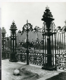
Gates at the Kensington Gore entrance to Hyde Park, London. These gates were cast by the Lion Foundry to replace originals made by the Coalbrookdale Co Ltd for the Great Exhibition of 1851.