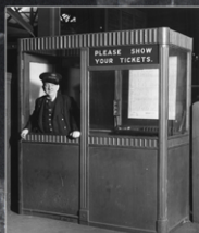
Railway ticket collector's kiosk, London, and North Eastern Railway, 1940s