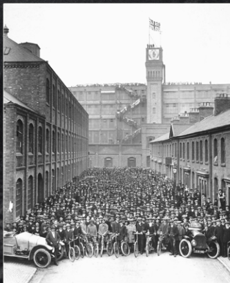
Cast-iron stair cases and fire-escapes were a speciality of the Lion Foundry. This example was supplied to Rudge-Whitworth Limited, bicycle and motorcycle manufacturer of Coventry, c 1910. The photograph shows staff filling the street in front of the factory, lining the fire-escape on the side of building and even standing on the roof of the factory.