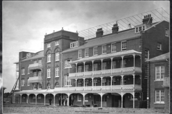
Balcony-verandah at the rear of the Grand Stand Building at Ascot Racecourse, c 1901