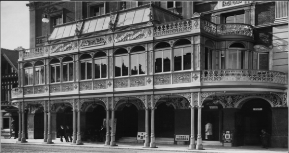
Balcony-verandah for the Theatre Royal, Portsmouth, c 1920

By the end of the nineteenth century business was booming, as reported in the Kirkintilloch Herald of 29 November 1899 'A BIG ORDER – We are gratified to learn that the Lion Foundry Company have been successful in securing a large English order that will ensure a briskness in certain departments for months to come. It is an arcade for Leeds, in which ornamental castings will play a large part. The Company have also an order for a theatre shelter in Nottingham, and are presently engaged upon the pavilion in the Ranger's ground at Ibrox.'