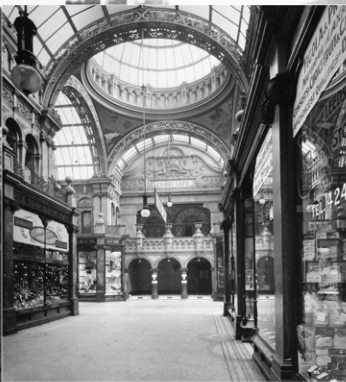
View of the completed arcade interior showing the Lyons Tea Room, 1900.

The period 1900-1914 saw the heyday of the Lion's ornamental cast iron work. The foundry was involved in large constructional ironwork projects in cities all over the UK, from Glasgow and Edinburgh to Manchester, London, Birmingham and Portsmouth. One of the most prestigious jobs of this period was the Leeds County Arcade mentioned above, for which the Lion supplied and erected the highly ornamental roof trusses, domes and balcony railings. With the outbreak of war in 1914 the firm returned to producing more utilitarian castings. It also manufactured bombs, a special cupola being installed for this purpose.