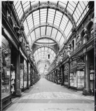
Completed arcade interior 1900